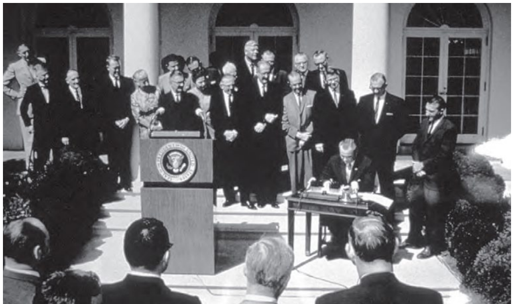
United States Forest Service

We have come a long way from the "howling wilderness" that Roderic