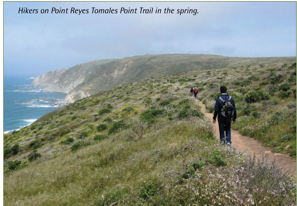
Hikers on Point Reyes Tomales Point Trail in the spring.

Phillip Burton Wilderness, established in 1976 as a portion of Pt. Reyes National Seashore and named for the 11-term Congressman in 1985, has been so beset by controversy in recent years that few have stopped to consider what might have happened to the Seashore without it. An observer said: "In one sense the most beautiful vistas on this