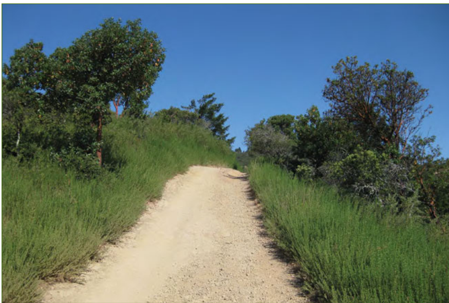
Marin County Parks

Invasive broom encroaches on both sides of a Blithedale Ridge fire road