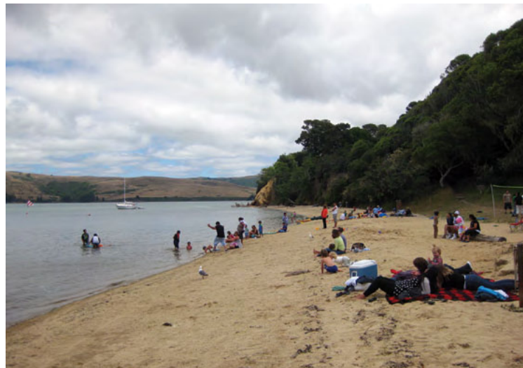
Visitors from around the Bay Area visit Tomales Bay State Park in the summer months.