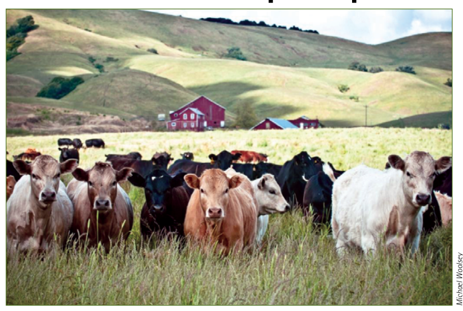
The 585-acre Dolcini Ranch, in Hicks Valley, is one of the nearly 45,000 acres on 69 Marin farms and ranches protected from development by a MALT agricultural easement. 20% of Measure A funds would be devoted to farmland protection.