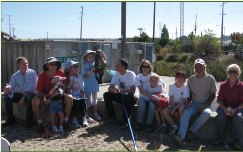
Coastal Clean Up