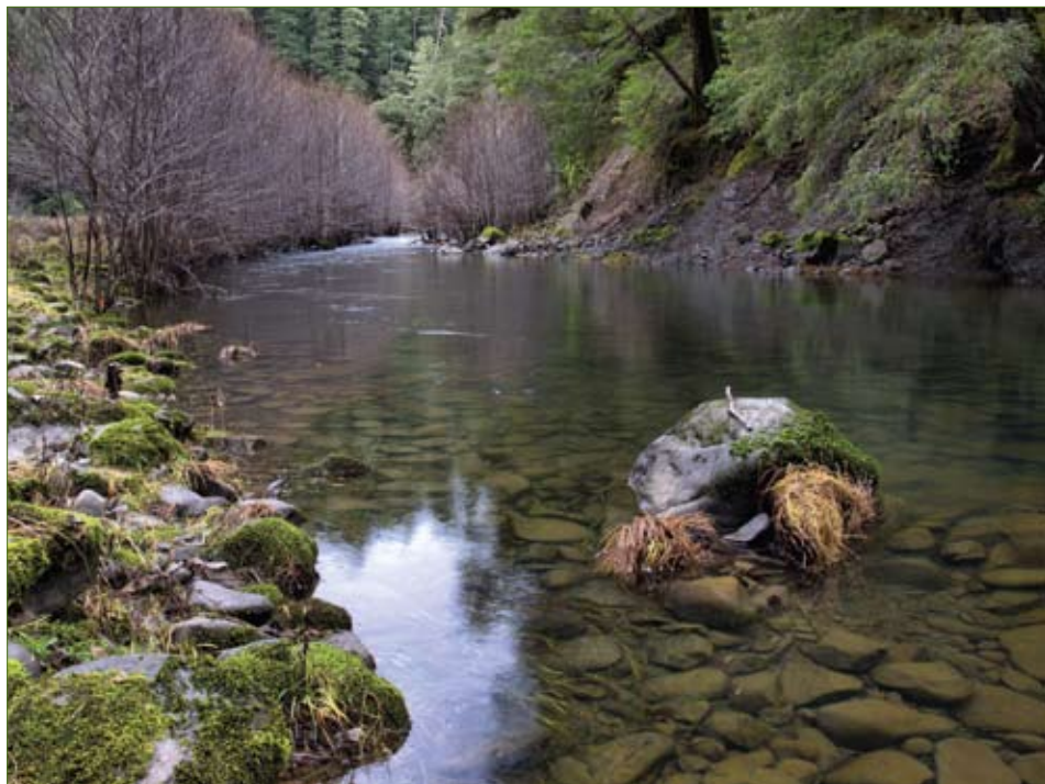
The scenic South Fork of the Eel River

Many customers of Marin's water districts know there are multiple sources of drinking water, but few give much thought to its distant origins as they turn on the sprinklers or ruminate in the shower. Beginning in 1906, two dams were built across the upper reaches of the Eel as part of the Potter Valley (formerly, Eel River) Project to divert water through a mile-long tunnel (see map on page 9) to the much more populous but smaller Russian River drainage area to the south and to generate a small amount of power in the process. The result was a much higher flow in the Russian River and a drastically decreased flow in the Eel, which is a federal and State designated Wild and Scenic River that drains the third largest watershed contained entirely within California. That diversion, plus water from Lake Sonoma on Dry Creek, provides water via the Russian River to Sonoma County Water Agency (SCWA). SCWA, in turn, delivers water to numerous contractors, including both NMWD and MMWD, which is at the end of the line. The Eel River/Russian River system gives rise to myriad environmental issues that provide at least partial explanation