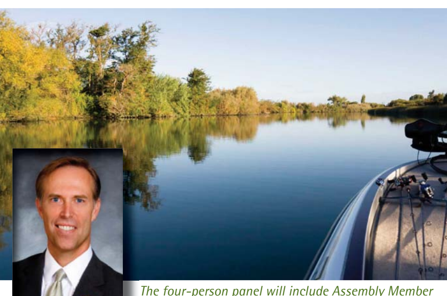
Jared Huffman and other experts on our water system

he Delta Next Door is the timely topic for MCL's fall Business-Environment Breakfast, October 1, 7:30 to 9:30, at the Embassy Suites in North San Rafael. It is easy to think that because we in Marin do not get OUR water supply from the Sacramento-San Joaquin Delta it is not our concern. But, in fact, the Delta's problems are everyone's problems. The Delta is a system that must support multiple ecosystems - 40 percent of the state's watersheds drain into the Delta, through the San Francisco Bay and out to the vast Pacific Ocean. At the same time, the Delta's network of islands, sloughs and wetlands channels water to agriculture and municipalities that comprise two-thirds of the state, including much of the Bay Area. Everyone agrees that the system is profoundly broken.