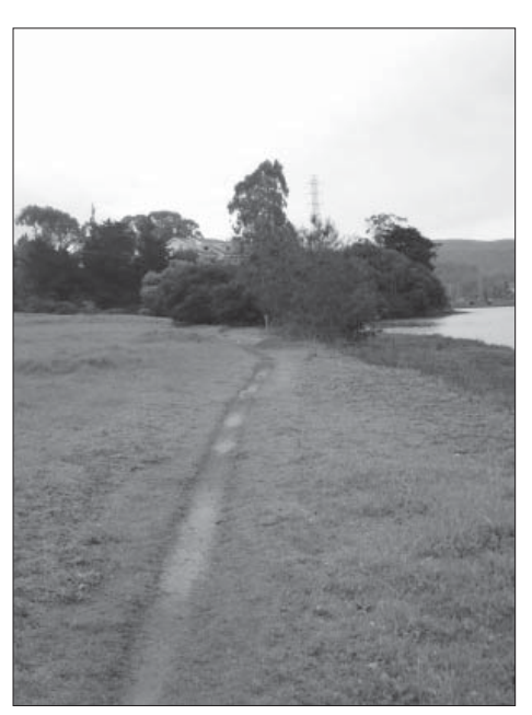
A good day for ducks at Bayfront Meadow, Mill Valley

ton Drive, across from the Mill Valley Public Safety Building, and the 800-foot tidal shoreline of Upper Richardson Bay. The views of the opposite shoreline, with the hills of Mill Valley and Mt.Tamalpais beyond, are spectacular, but the terrain was in shoddy condition as a result of various construction activities years ago.