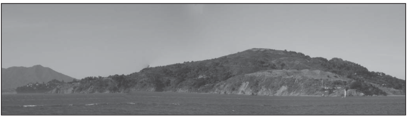
Visible charring on the south side of Angel Island and Mount Livermore