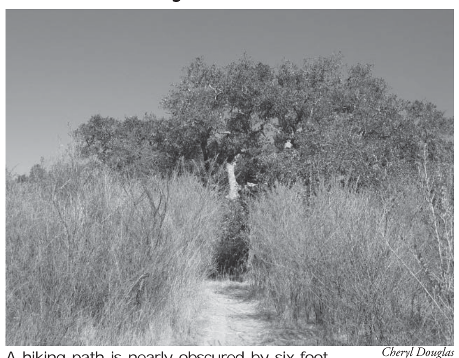
A hiking path is nearly obscured by six-foot stands of invasive French Broom