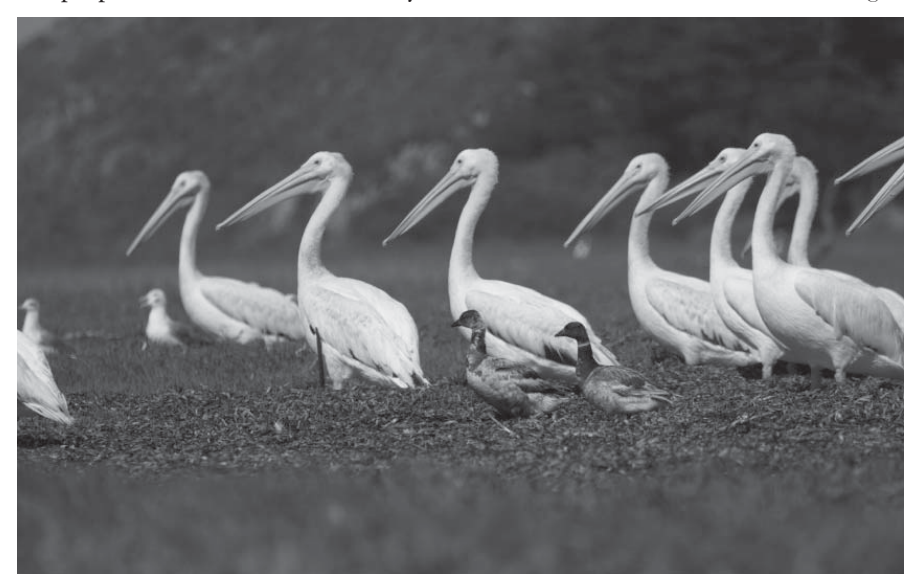
Tomales Bay Parade