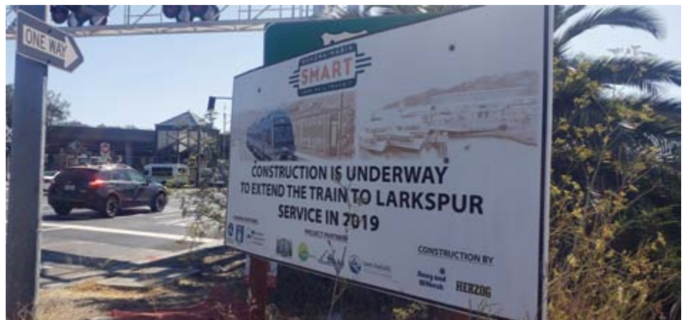
The SMART extension to Larkspur and increasing rail car capacity received funding from the State's cap-and-trade program.

In 2018, California's cap-and-trade program revenues were used to pay for $1.4 billion in projects ostensibly aimed at also reducing GHG emissions. Projects funded ranged from electric vehicle rebates and charging