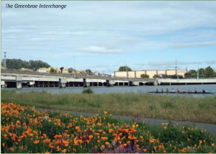
The Greenbrae Interchange