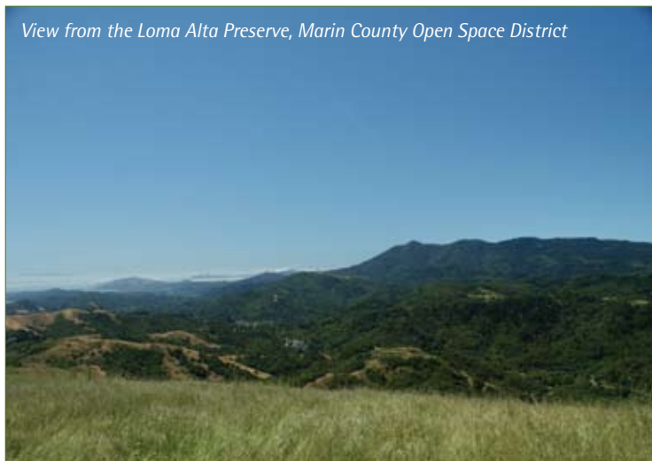
View from the Loma Alta Preserve, Marin County Open Space District

Opposed a Metropolitan Transportation Commission (MTC) proposal to adopt an 800-mile network of High-Occupancy Toll (HOT) Lanes throughout the Bay Area and encouraged the MTC to disclose the effects of such lanes on vehicle miles traveled, greenhouse gas reduction, and social equity.